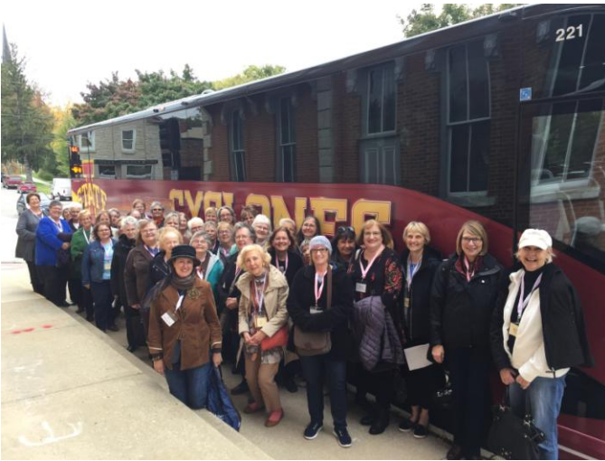
Fall Trip Riders

Forty one members left early on October 15 to meet the Cyclone bus in the Hy-Vee Lincoln Center parking lot for a wonderful day in Northeast Iowa. After a three hour bus ride, members were met by docents at the Laura Ingalls Wilder Museum in Burr Oak. They provided a lot of information about the year the Ingalls family lived in Burr Oak and operated the Hotel as well as the life and times of Laura.