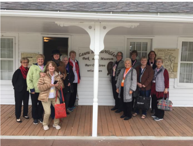
Laura Ingalls Wilder Museum

A delightful lunch was served by a Mennonite caterer at the Wildberry Winery near Decorah. The lunch location provided an opportunity to sample wines made at the winery. Next stop was 'Seed Savers' to learn a little about the organization and to browse or purchase garden items available in the gift shop. Arriving in Decorah, members were welcomed at the Vesterheim Norwegian-American Museum; there was also time for exploring Decorah's historic downtown. The last stop in Winneshiek County was at Dunning Springs where travelers enjoyed the beautiful waterfall and freshwater stream. Enroute to Ames, a stop was made in Waterloo to pick up box meals from Subway for supper on the bus. It was a marvelous day. Check Facebook for more photos, they tell the story well.