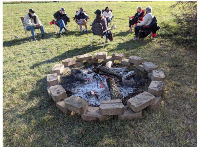
Couples Group Bonfire