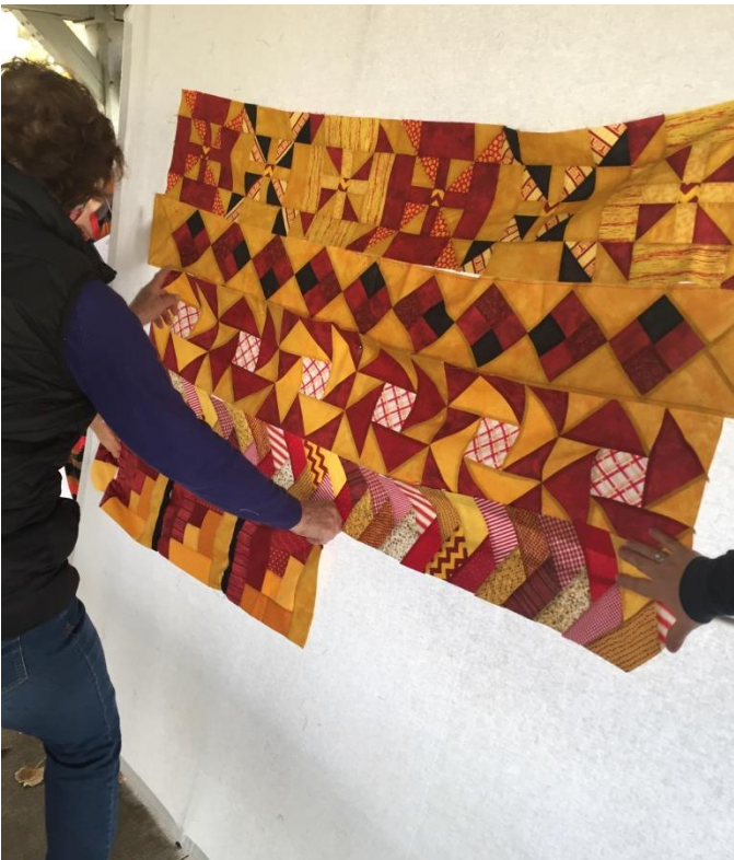
Block Builders teaser for one of the raffle quilt block builders is assembling, all in Iowa State colors.