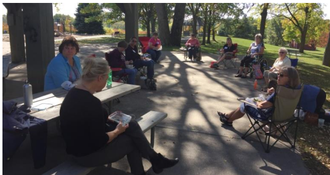
Iowa Cafe Adventures at Moore Park