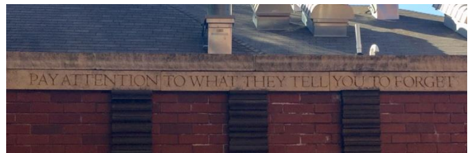
Art and About from their campus art walk