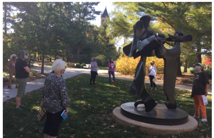
Art and About on a campus art walk