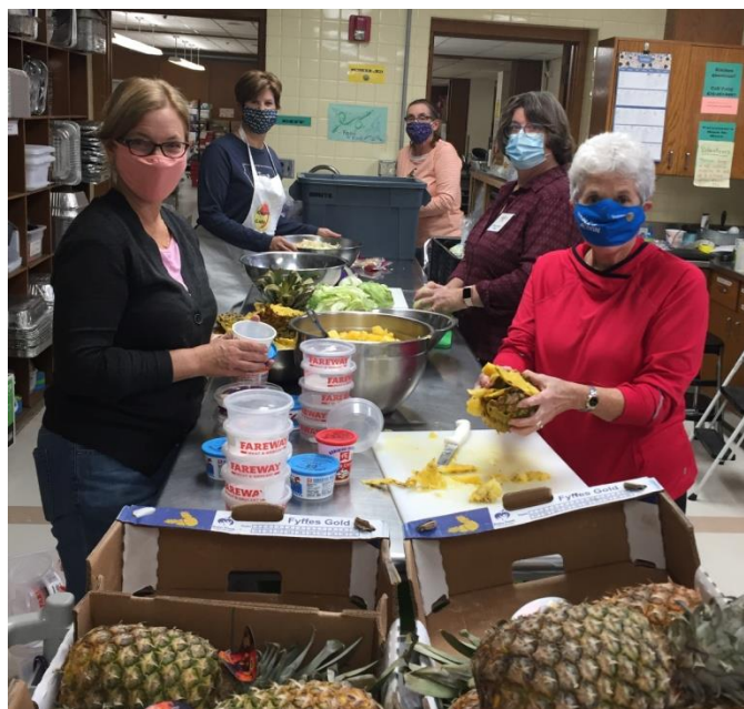
G.I.V.E. volunteers at Food at First

Last year G.I.V.E. members volunteered at Food at First, helped to assemble winter kits for the homeless, adopted a large family for Christmas through YSS, and donated lunch food items for the homeless. Then COVID hit and activities came to a halt. Other scheduled activities that were cancelled were volunteering at Ames Animal Shelter, Special Olympics and Harmony Clothing Closet. In 2020, the group gained 10 new volunteers and currently they help at Bethesda Food Pantry every Thursday and work a meal prep shift at Food at First once a month.