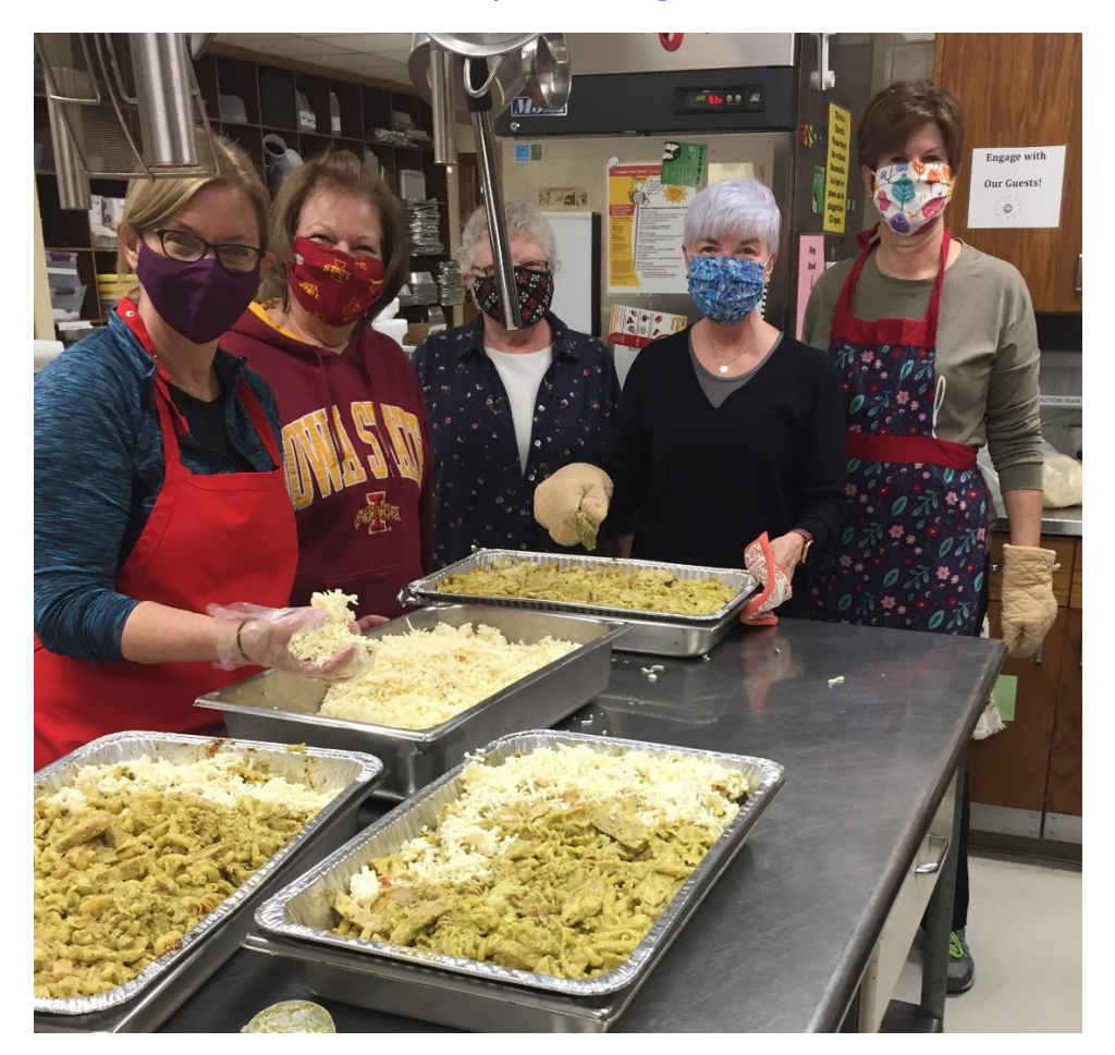
G.I.V.E. group at Food at First