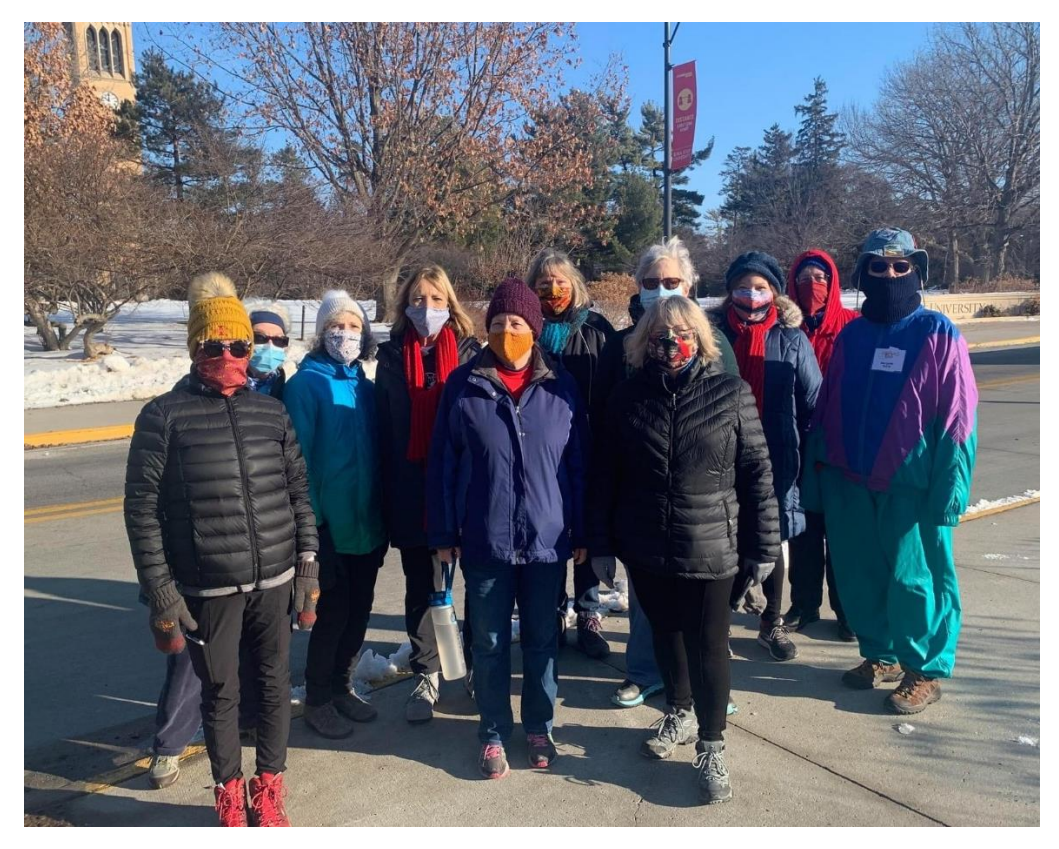
A group hike on a chilly January morning