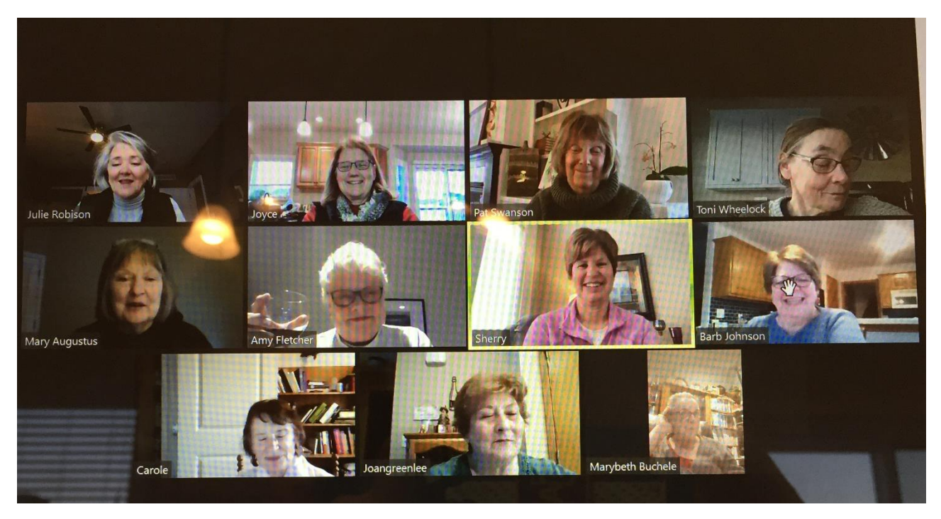
Zany Zins Zooming