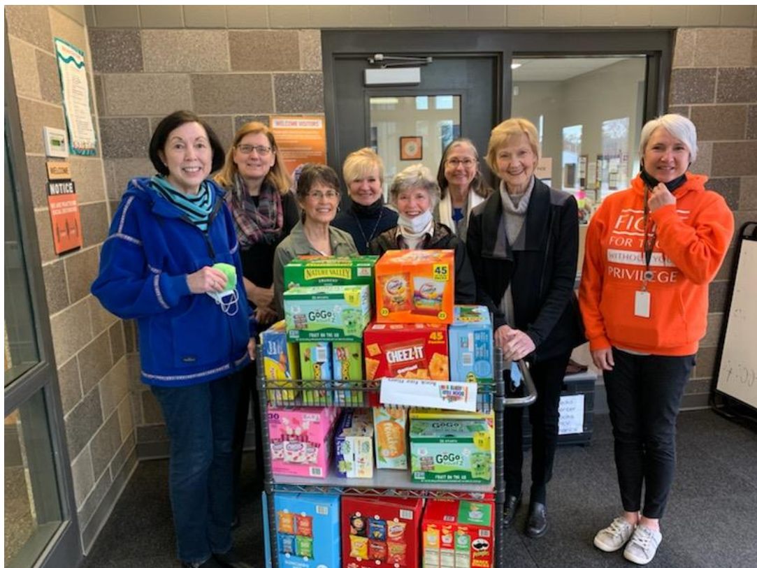
Taste Buds collected snacks for Meeker Elementary School