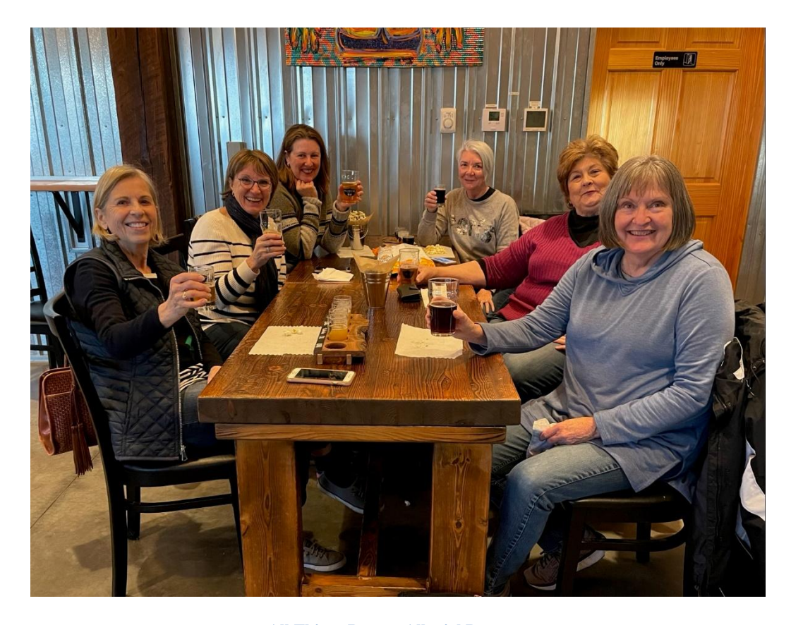
All Things Beer at Alluvial Brewery