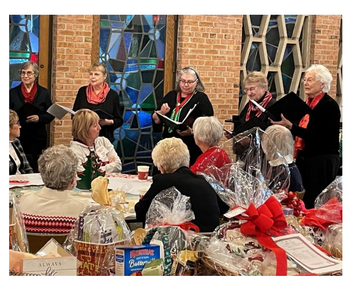
The Belles of Iowa State