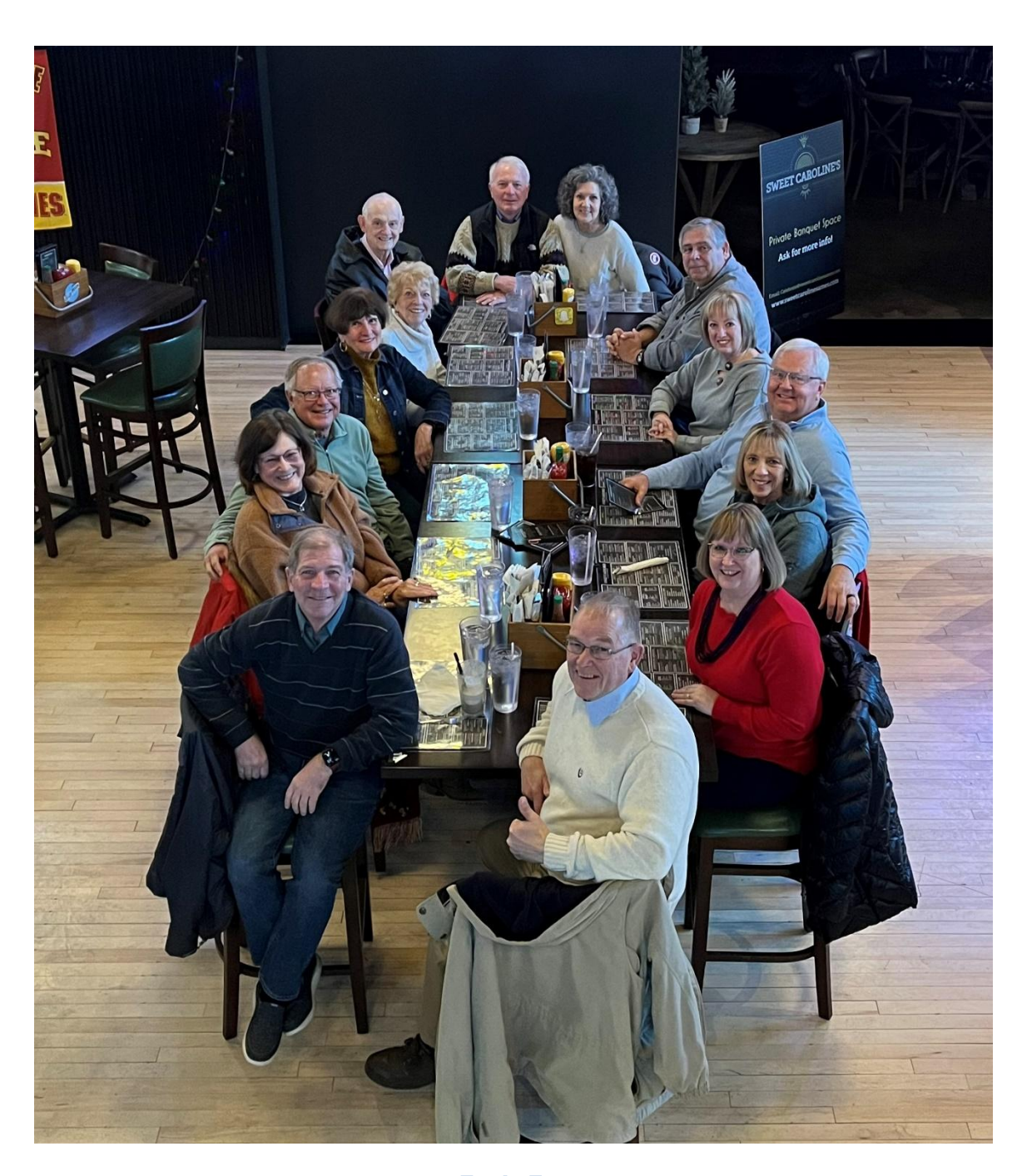
Two by Two