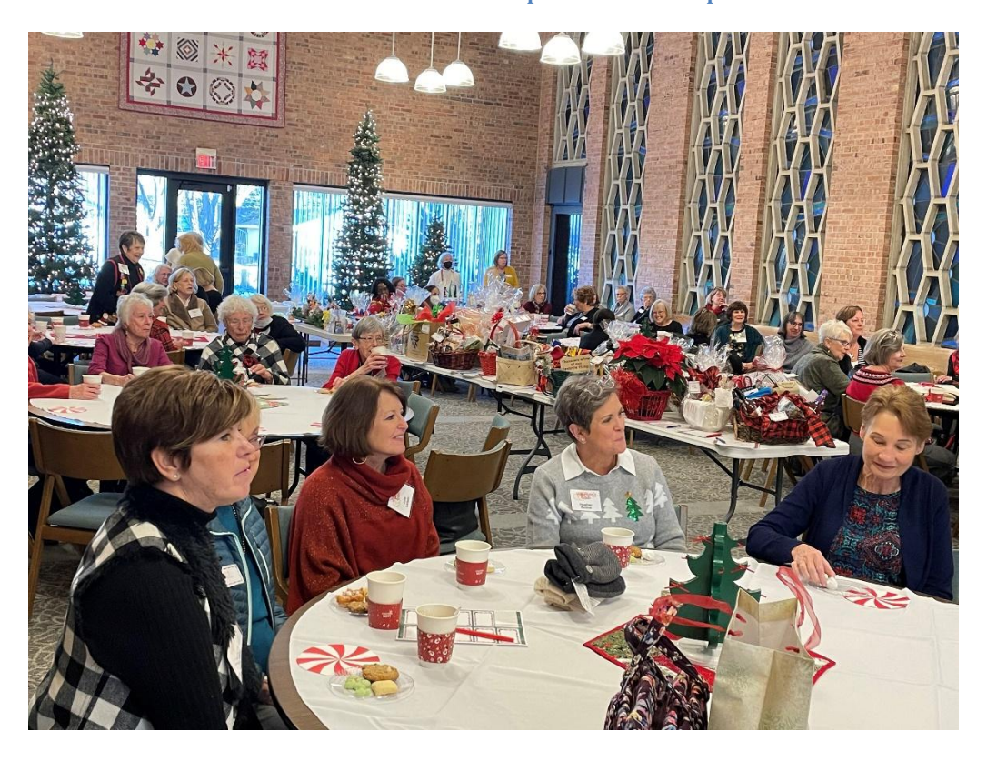
Christmas baskets and members enjoying the program