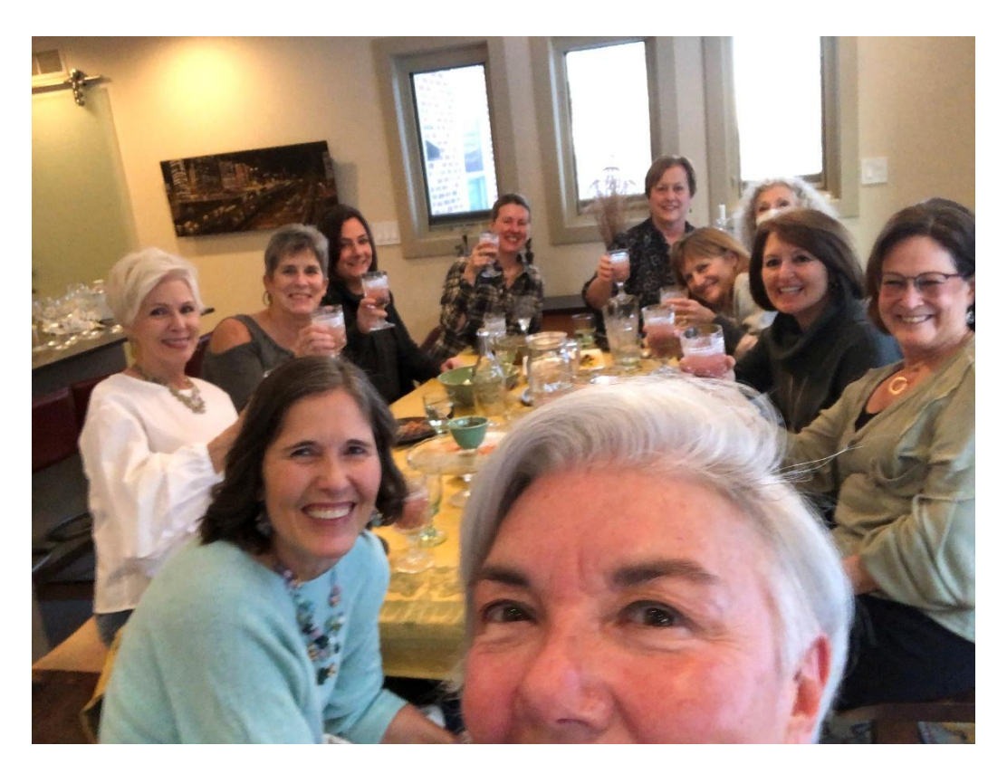
Wink N Dwink