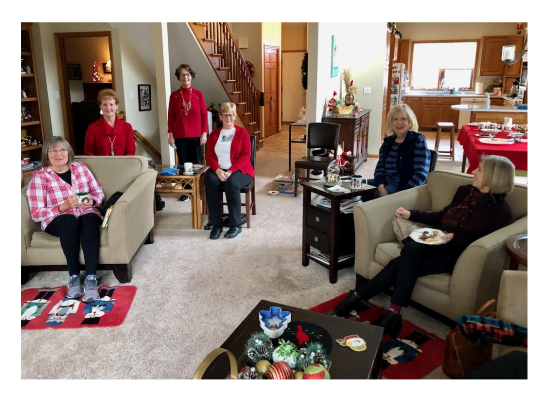
Time of Your Life Book Group in December