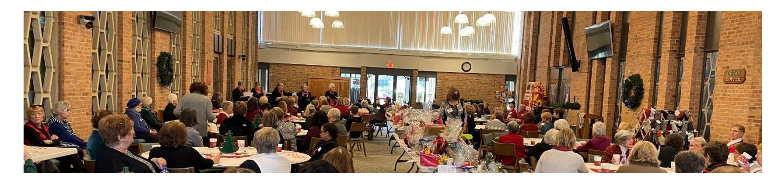
The Well Attended Christmas Market