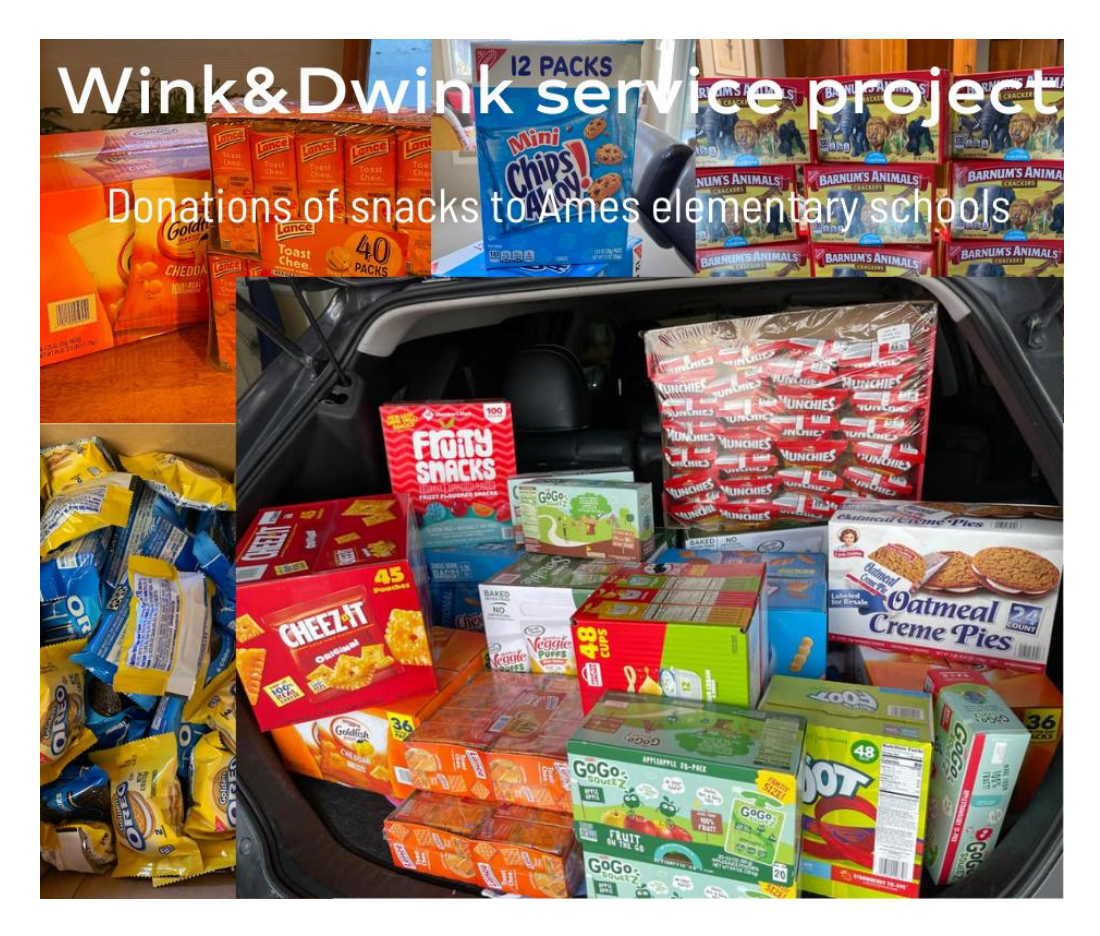
Wink and Dwink service project