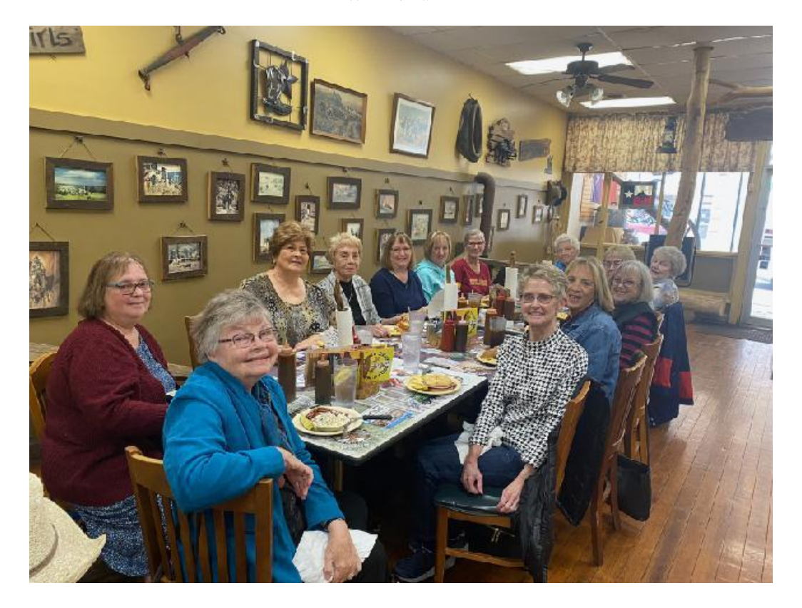
Lunch Bunch at Jimmy's BBQ in Boone