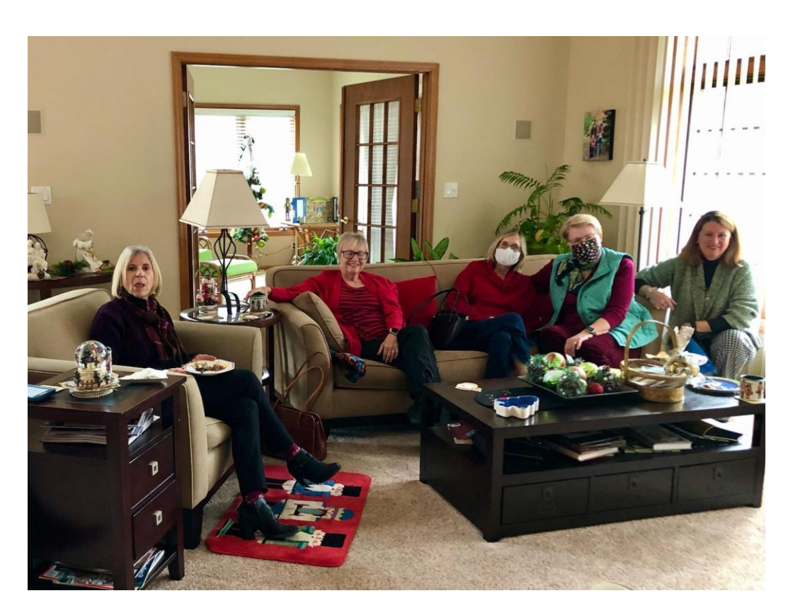
Time of Your Life Book Group in December