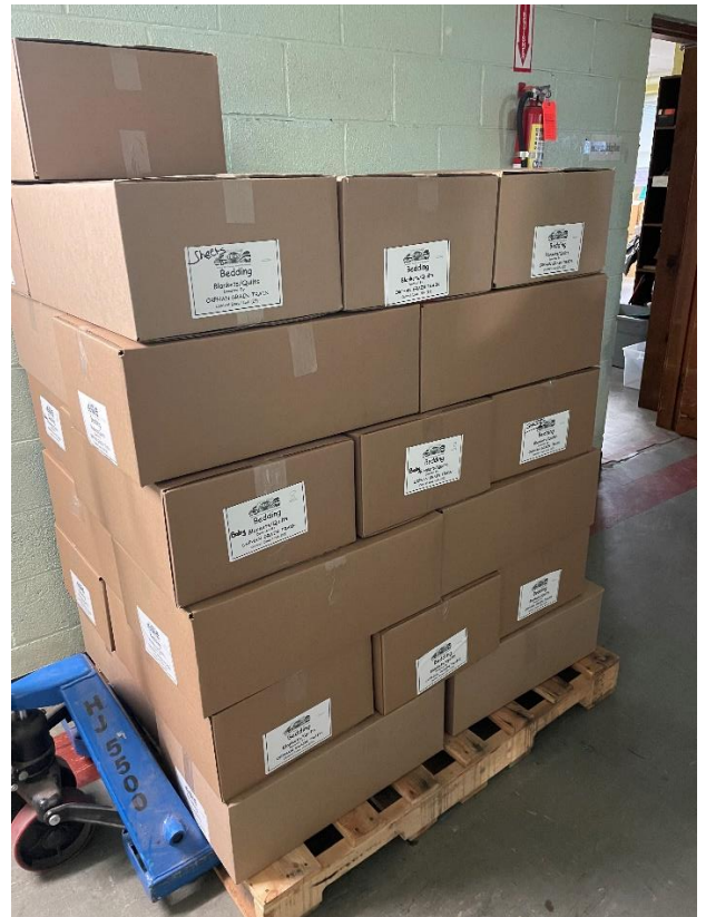
Boxed Items for Ukrainian Refugees