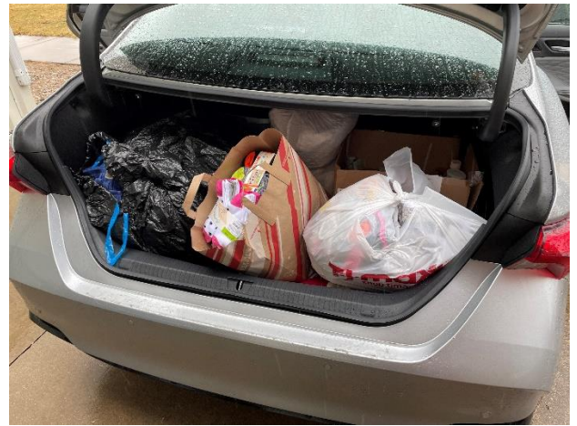
Donated items for Ukrainian Refugees filled 3 cars